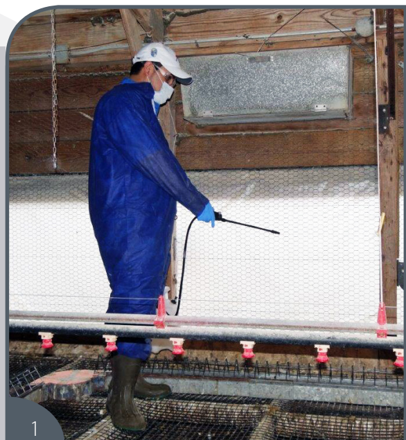
1 Non-residual insecticide application.