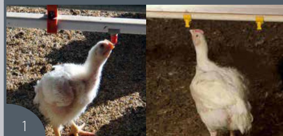
Manage drinking systems to reduce wet litter.