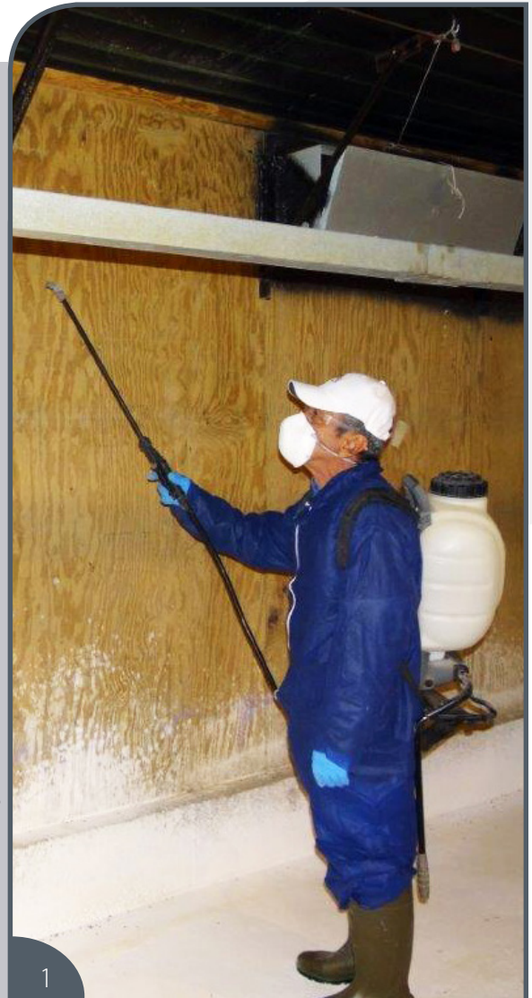
1 Apply insecticides to empty houses only.