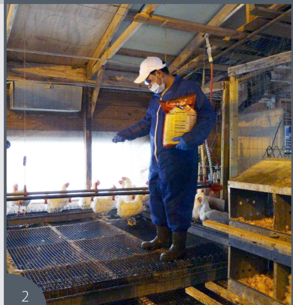
2 Larvicide granule application.