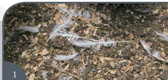
Dry, friable litter.