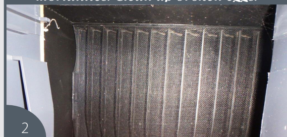
Screening in an air inlet.