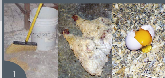
Clean up feed spills. Remove flock mortalities. Clean up broken eggs.