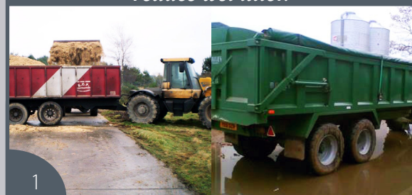
Removing litter from the farm.