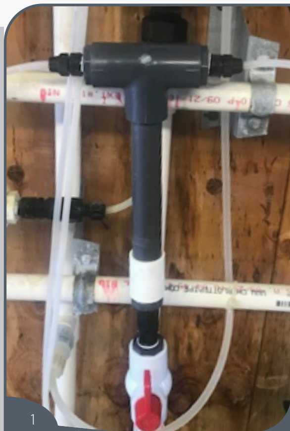
1 An in-line chamber provides improved reaction time for chlorine dioxide.